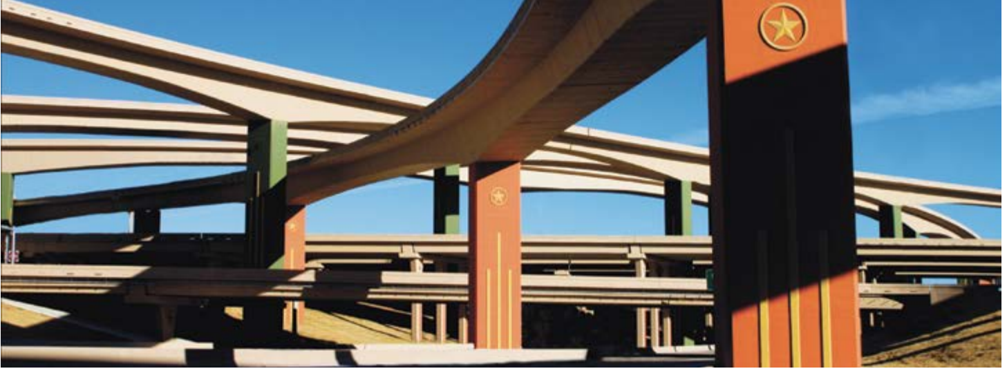
High Five Interchange in Dallas.