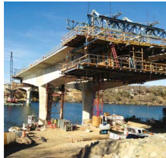
Lake Marble Falls Bridge in the Highland Lakes chain northwest of Austin.

For that reason and others, the state typically uses uncoated reinforcement for most bridges. “We are open to using epoxy-coated reinforcement if there is a compelling need, and we’ve even allowed contractors to use glass fiber-reinforced polymer reinforcement in place of epoxy-coated reinforcement if they want. With segmental designs, we’re always receptive to new types of reinforcement.” For segmental designs, TxDOT hasn’t used stainless steel reinforcement, even in marine applications. “We get so much deck compression by post-tensioning the components that we haven’t had a need to supplement it.” TxDOT, however, has specified stainless steel reinforcement in specific areas of conventionally reinforced concrete substructures in marine environments.