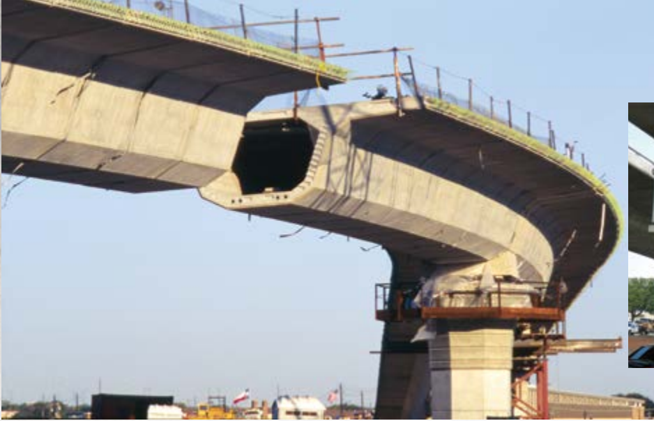
US 183 Bridge in Austin.