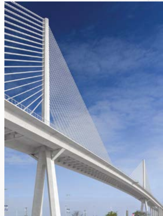
Corpus Christi Harbor Bridge.

More to the point, he says, current designs will achieve 100-year service lives unless funding and mindsets change dramatically. “If you look at budgets and the rate of replacement we’re seeing now, new bridges that we’re building are going to last 100 years whether we intend them to or not,” he says. “There won’t be the money or desire to replace them sooner. That reality gives us an incentive to find ways to ensure they will last that long. And we don’t hesitate to select a segmental concrete design to meet that need.”