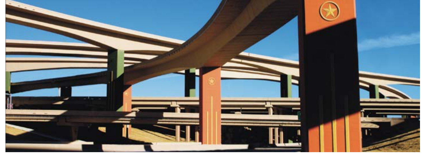
High Five Interchange in Dallas.