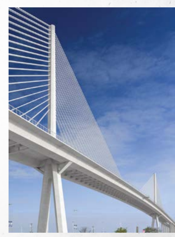
Corpus Christi Harbor Bridge.

More to the point, he says, current designs will achieve 100-year service lives unless funding and mindsets change dramatically. "If you look at budgets and the rate of replacement we're seeing now, new bridges that we're building are going to last 100 years whether we intend them to or not," he says. "There won't be the money or desire to replace them sooner. That reality gives us an incentive to find ways to ensure they will last that long. And we don't hesitate to select a segmental concrete design to meet that need."