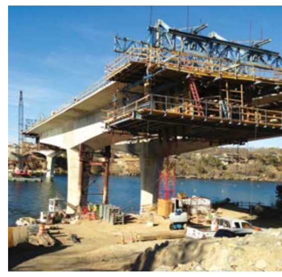
Lake Marble Falls Bridge in the Highland Lakes chain northwest of Austin.

For that reason and others, the state typically uses uncoated reinforcement for most bridges." We are open to using epoxy-coated reinforcement if there is a compelling need, and we've even allowed contractors to use glass fiber-reinforced polymer reinforcement in place of epoxy-coated reinforcement if they want. With segmental designs, we're always receptive to new types of reinforcement." For segmental designs, TxDOT hasn't used stainless steel reinforcement, even in marine applications. "We get so much deck compression by posttensioning the components that we haven't had a need to supplement it." TxDOT, however, has specified stainless steel reinforcement in specific areas of conventionally reinforced concrete substructures in marine environments.